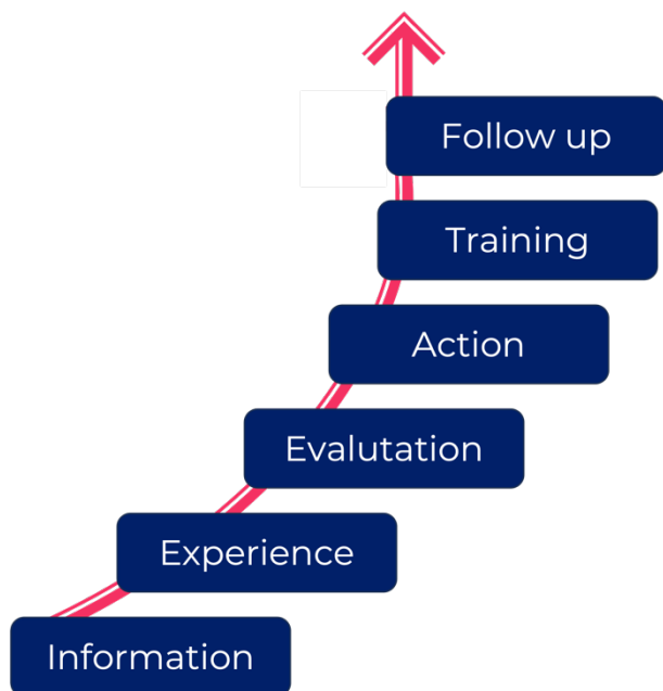
The staircase model for information transfer and processing of values and attitudes

We run both open and in-house training courses. Knowledge is the basis for fact-based decisions and a prerequisite for engaging management and staff. Knowledge is part of our approach to changing behavior. Simply providing information is seldom enough to make people act differently.